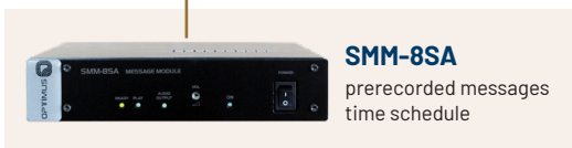
SMM-8SA prerecorded messages time schedule